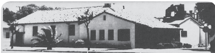
Second home of Santa Maria Elks Lodge No. 1538, located at the corner of East Main and South Vine streets. The lodge occupied the building for 33 1/2 years, until 1968. The lodge room had a capacity of 300 and the dining room seated 275. This fine building was designed by Louis N. Crawford, architect, first Exalted Ruler of B.P.O.E. 1538.